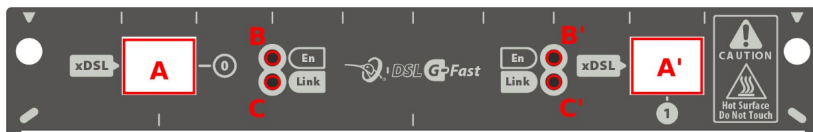
Fig. 3: Front of the double-port TBC1-GFAST card

The front board elements are as follows: