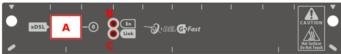
Fig. 2: Front of the single-port TBC1-GFAST card

Figure 2a shows the front board of the single-port TBC1-GFAST card: