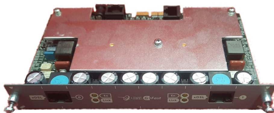
Fig. 1: TBC1-GFAST card

For further information on ADSL, VDSL2 and G.Fast technologies, please see the Teldat- Dm741-I ADSL-VD-SL2-GFAST manual.