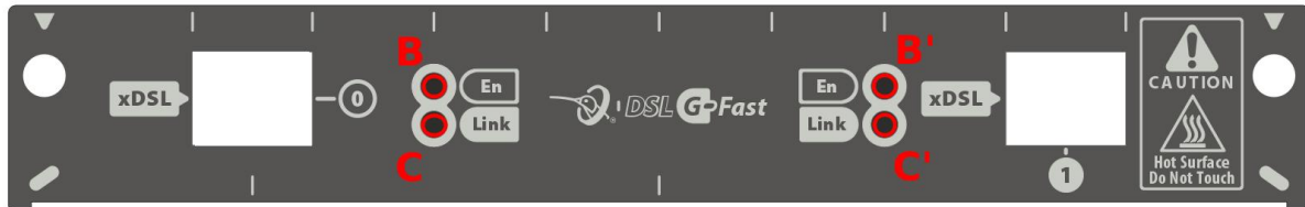
Fig. 4: TBC1-GFAST card : LEDs .

The TBC1-GFAST expansion card has two LEDs per port: En and Link.